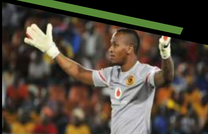
The Citizen Baroka FC beat Chiefs in Fame Charity Cup final | The Citizen

...victory of Kaizer Chiefs